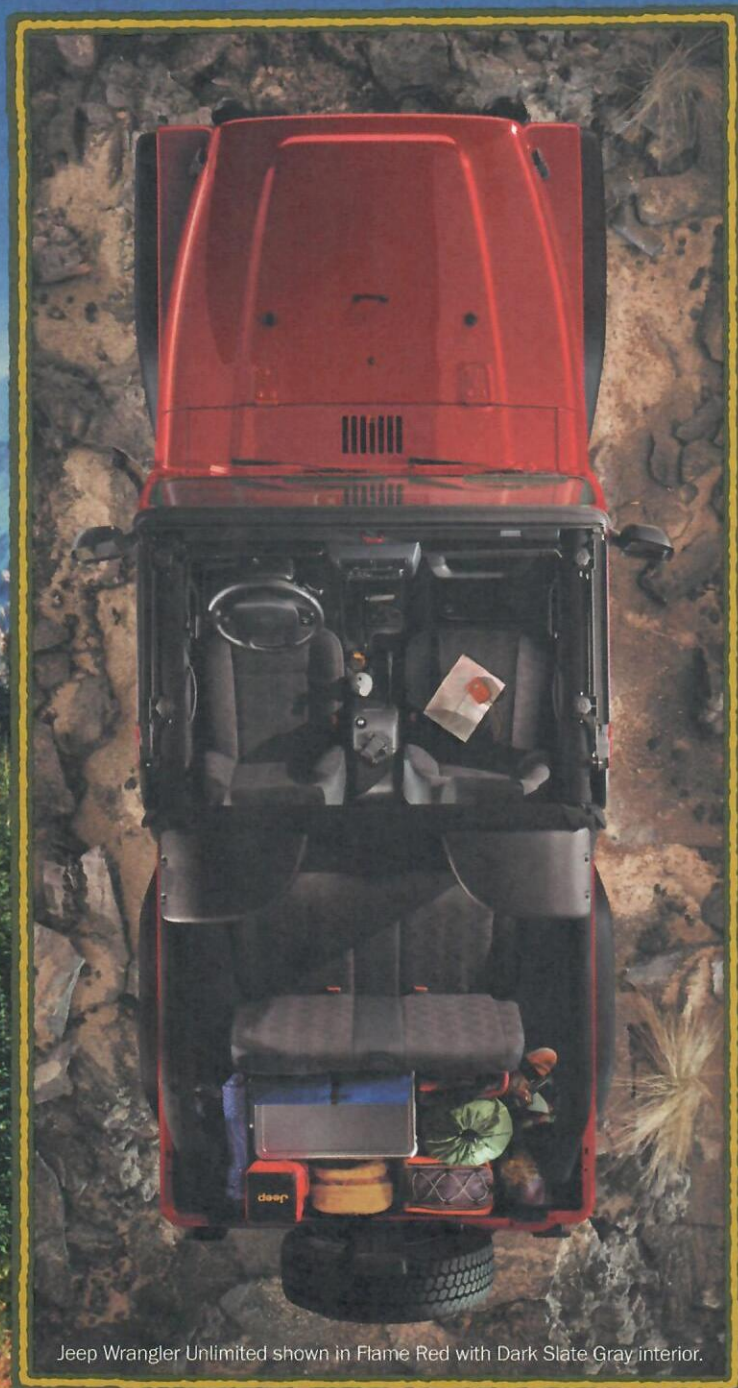
Jeep Wrangler Unlimited shown in Flame Red with Dark Slate Gray interior.