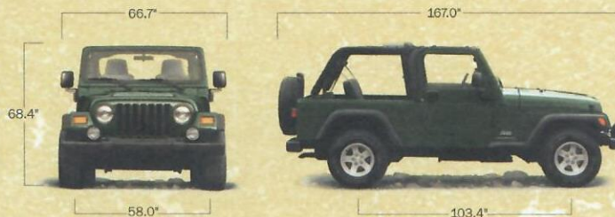
Jeep Wrangler Unlimited shown in Shale Green.

Based on the 2004 Ward's Automotive Small Sport/Utility vehicle segment.